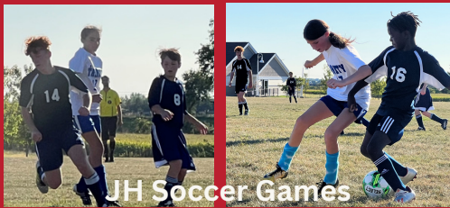
JH Soccer Games

For then you will make your way prosperous, and then you will have good success.