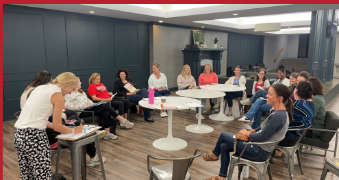
First PTO Meeting of the Year

This Book of the Law shall not depart from your mouth, but you shall meditate on it day and night, so that you may be careful to do according to all that is written in it.