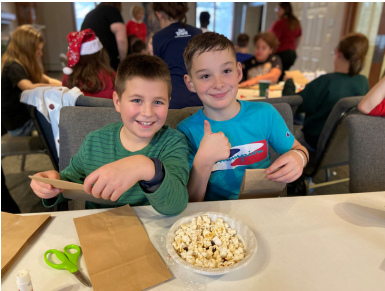
Elementary Class Parties